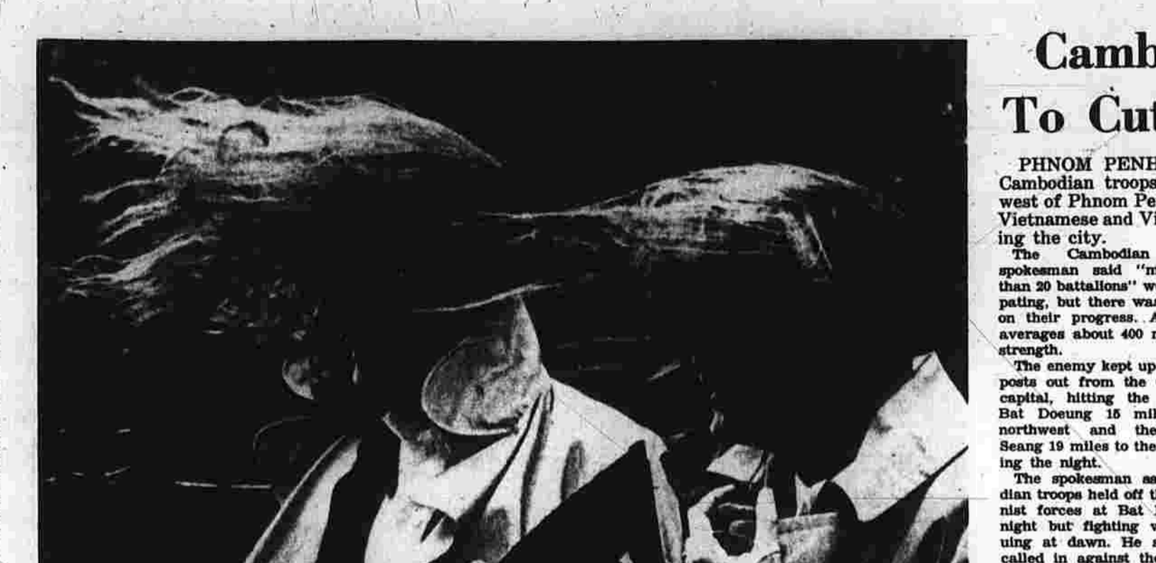
These two girls had no doubts on which direction the wind was blowing, but they may have wondered about the velocity. It reached 60 miles an hour in areas of Delaware, site of photo.

WASHINGTON (AP)—Blue Cross was accused Wednesday of promoting unnecessary hospitalization and contributing to rising hospital costs by paying hospitals what they choose to charge. The Senate Antitrust and Monopoly subcommittee heard recommendations that hospital administrators and personnel be excluded from the governing boards of Blue Cross plans.