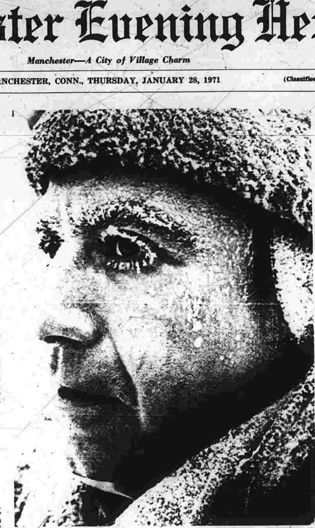
The face of this Rochester resident tells the story of the violence of the blizzard which paralyzed Upstate New York with its high winds. (AP Photo)

Blasts and raging flames in Philadelphia suburb destroyed more than one dozen homes. (AP Photo)